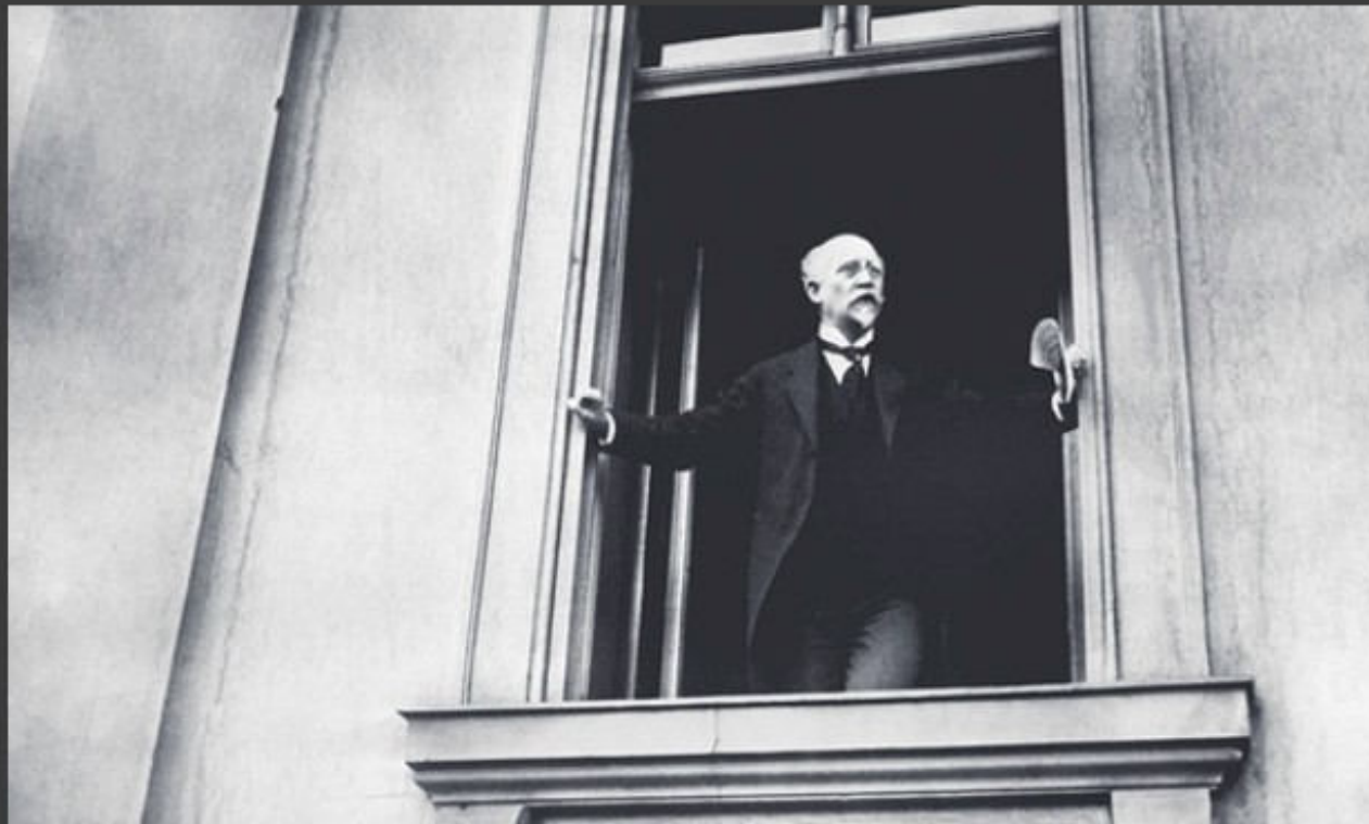
Philipp Scheidemann spricht aus einem Fenster der Reichskanzlei

November- revolution: End of the German Empire and birthday of Weimar Republic, Germany's first democracy