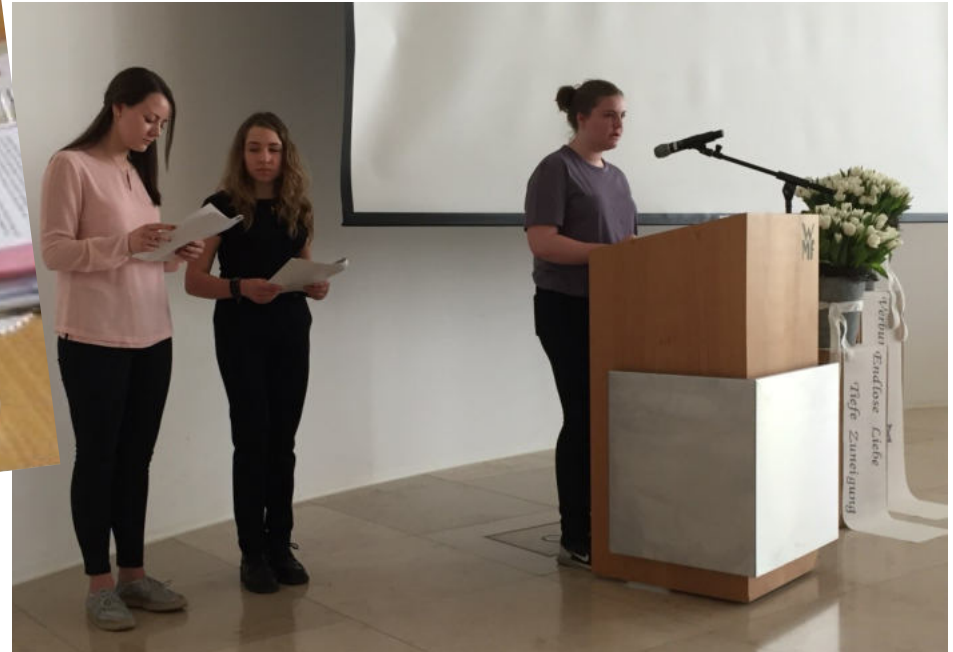
Students of MiGy high school read these names out loud at Geislinger memorial events.